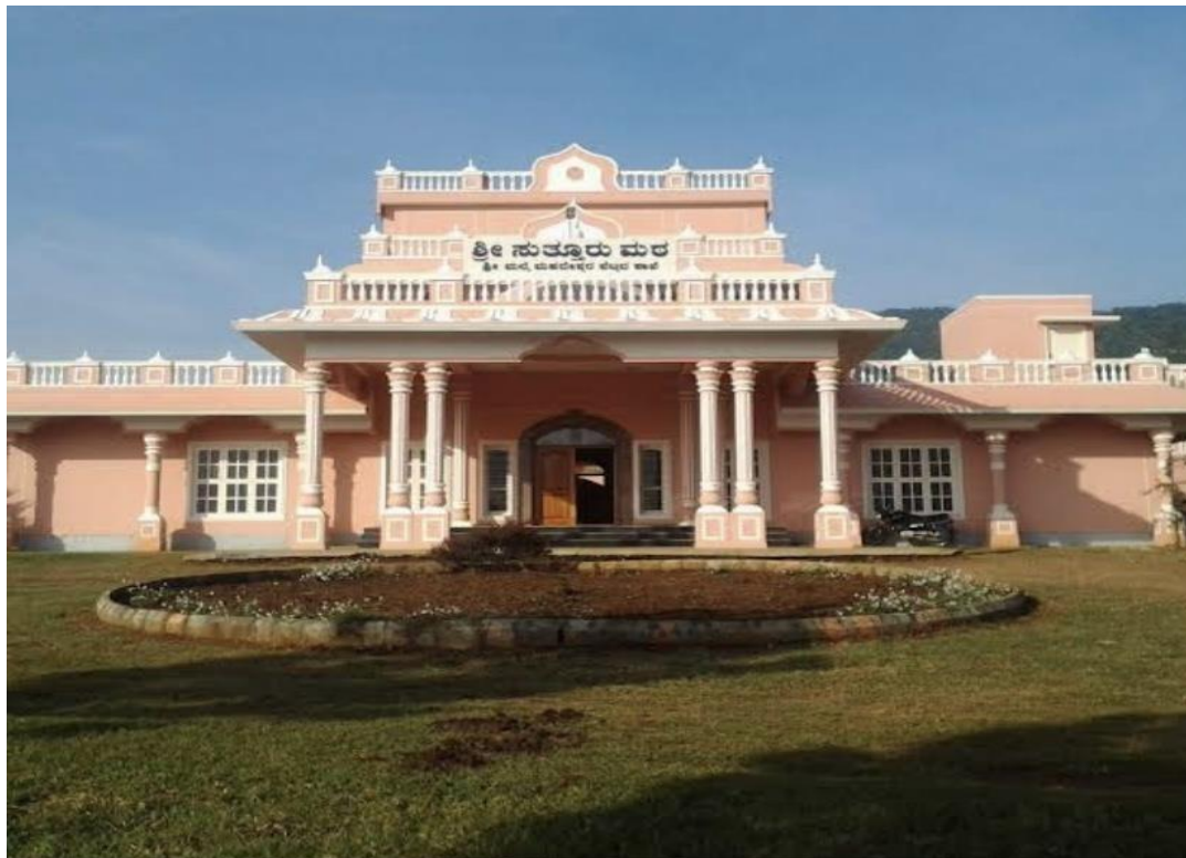
Guest house at Malai Mahadeshwara Hill