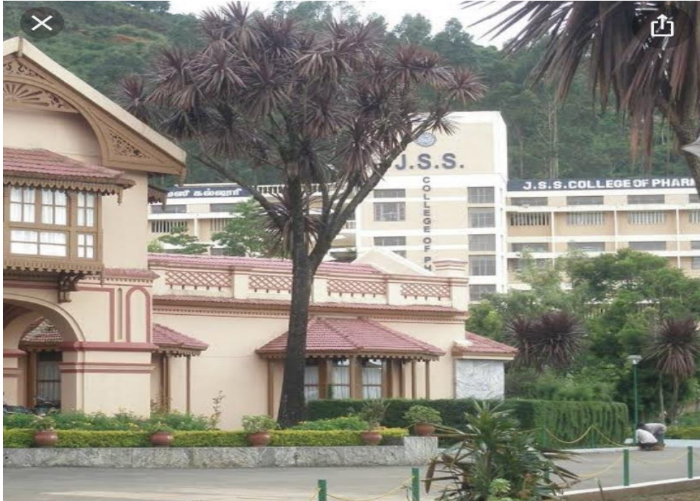
Guest house at Ooty