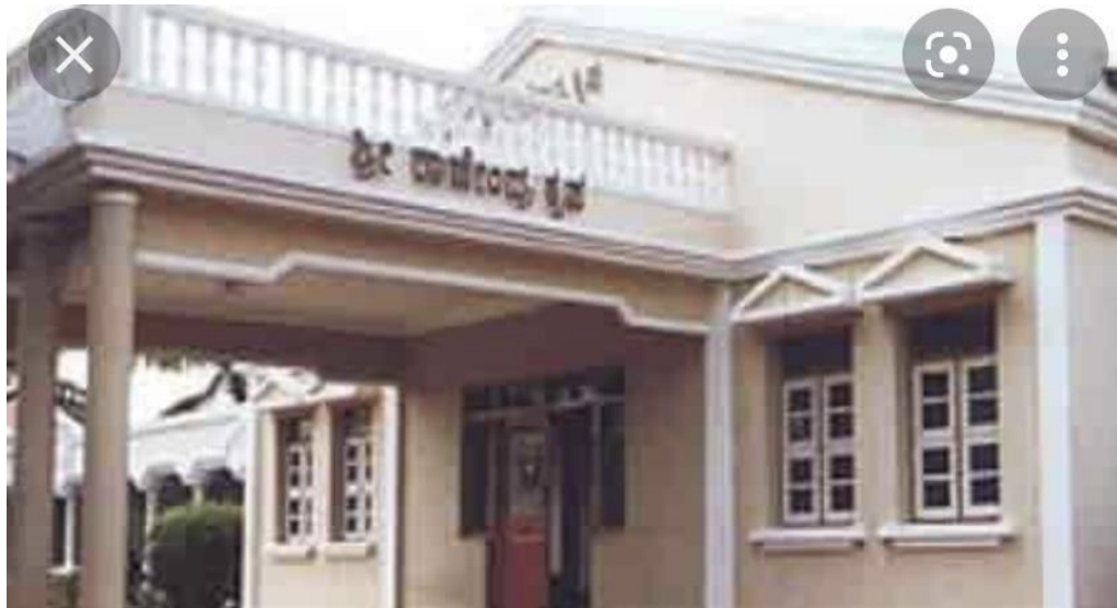
Guest house at Suttur Sree Kshethra, Suttur