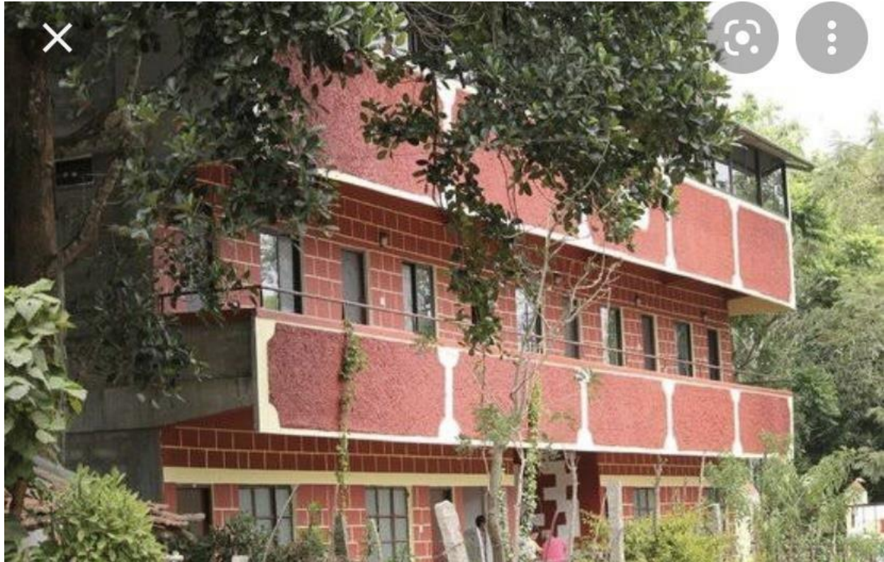
Guest house at Biligiri Ranganath Hills