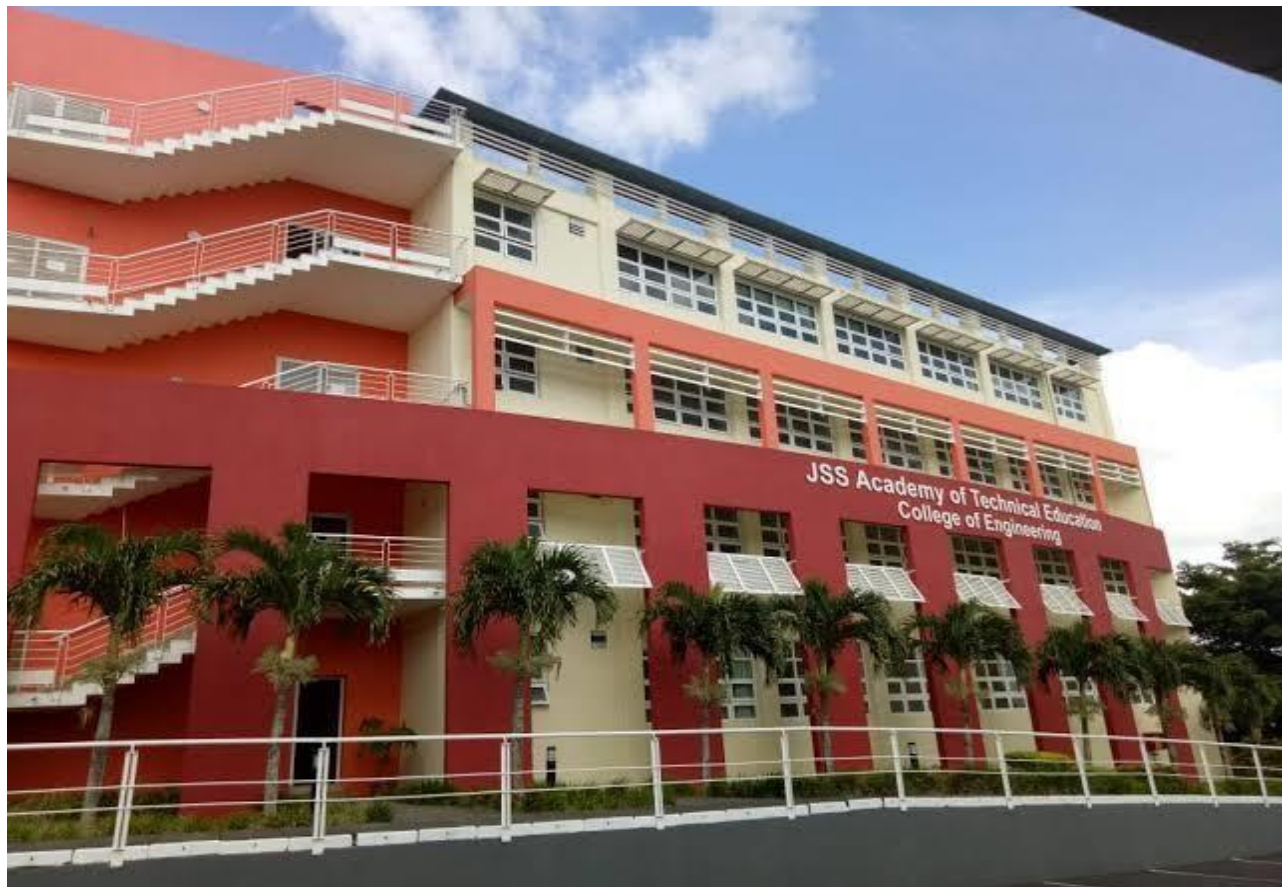
Guest house at Mauritius